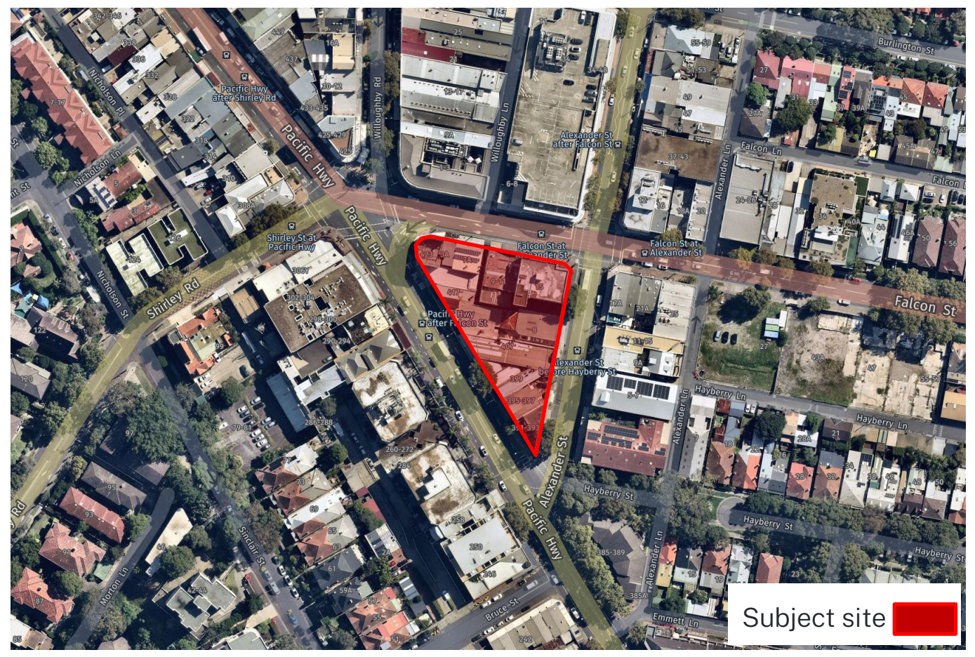
Figure 1 - Subject site

The site comprises of nineteen lots bounded by the Pacific Highway, Falcon Street and Alexander Street and is known as the Five Ways Triangle. The site is triangular and approximately 3200m<sup>2</sup> and is currently occupied by a mix of 1-4 storey commercial buildings. The site is currently zoned B4 Mixed Use under the North Sydney Local Environment Plan (LEP) 2013.